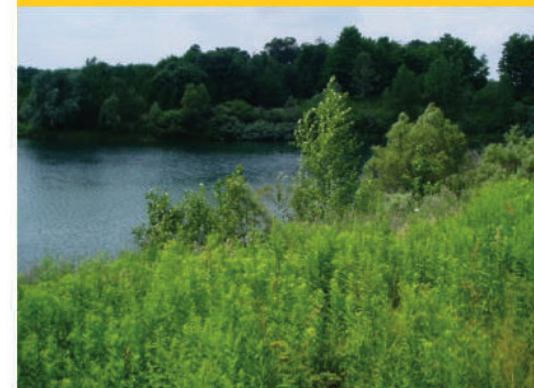
Progressive rehabilitation at St Marys Aberfoyle Pit Aberfoyle, Ontario

St Marys Flamborough Quarry Community Newsletter Issue #2 August 2006